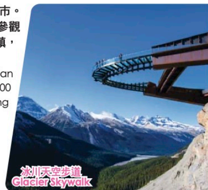
冰川天空步道 Glacier Skywalk

Proceed to Eagle Pass and visit the Last Spike of the Canadian Pacific Railway. Head west to Kamloops, a city with over 2000 hours of sunshine each year. Visit the only GMP certified Ginseng factory. Return to Vancouver by late afternoon.